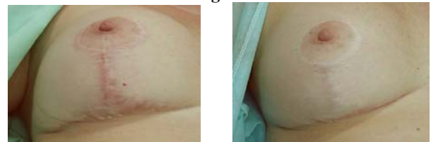
Laser LP Nd:YAG 1064nm + LEO 540nm handpieces