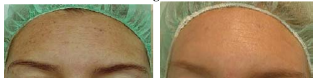
LEO 540 + 570nm handpieces