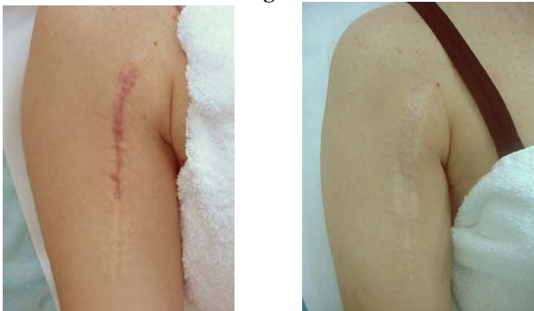
Laser LP Nd:YAG 1064nm + LEO 540nm handpieces

Today combined therapy modalities and procedures are being researched by numerous equipment providers and practitioners. Preliminary and ongoing clinical trials