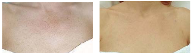
LEO 540 + 570nm handpieces