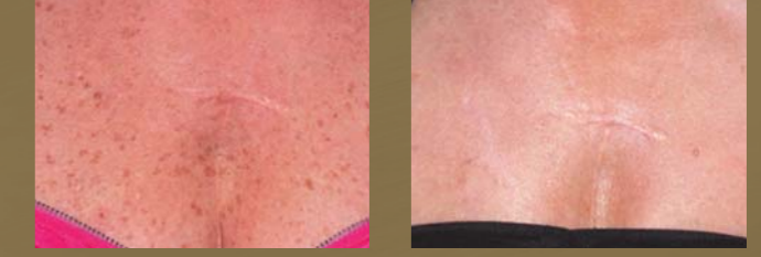
After 5 Tx.