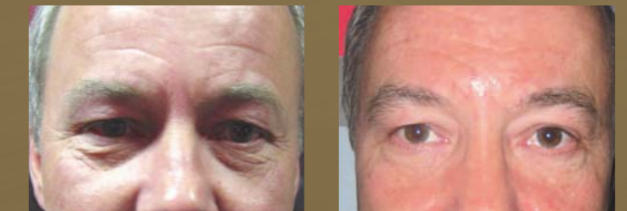
After 1 Tx.