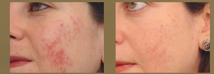
After 2 Tx.