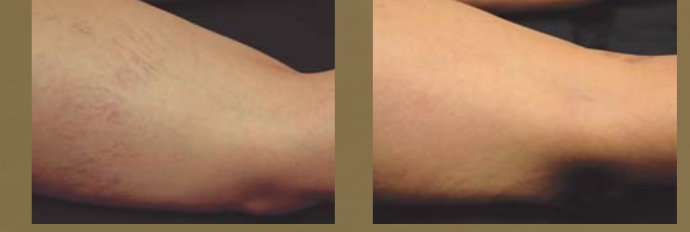
After 3 Tx.