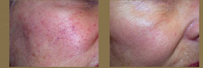
After 5 Tx.