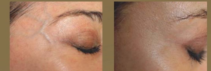
After 2 Tx.